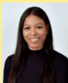
Coach Singley ES Cross Country