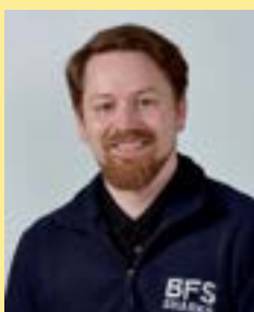
Coach Kavanaugh ES Cross Country